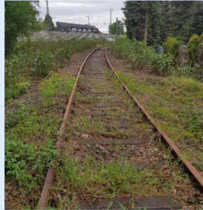
Figure 2: Detection and management of vegetation between and next to railway tracks

To guarantee the safety of the trains circulating in the area in which the robot is operating.