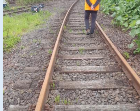
Figure 1: Detection and management of vegetation between railway tracks