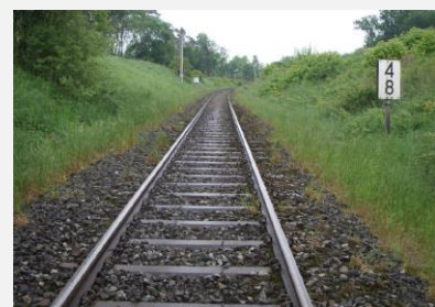
Figure 2: Detection and management of vegetation next to railway tracks